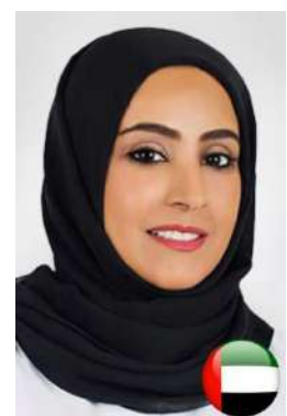
Sheikha Noura Al Qassimi